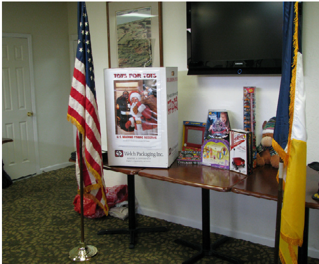
Chapter members brought toys for the Toys for Tots program.